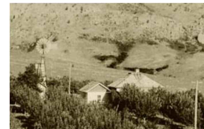
Photo: Purchased in 1898, the Batchelder Ranch at Chautauqua Meadow became the first property acquired by the city in what has become Open Space & Mountain Parks.

Open Space & Mountain Parks receives much of its funding through sales tax revenues. Shopping in Boulder helps acquire and preserve more land while supporting trails, habitat protection, education and farming.